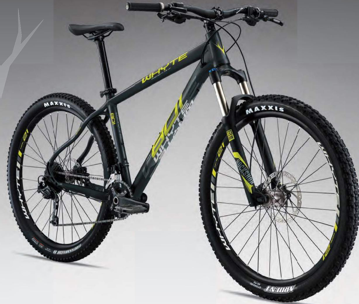
Shimano/SR Suntour 2 X 9spd drivetrain provides gears for all terrain / Maxxis front and rear specific tyres / RockShox 120mm 30 Silver fork with TurnKey lockout and Solo Air TRAIL HARDTAIL - 800 SERIES - 120MM