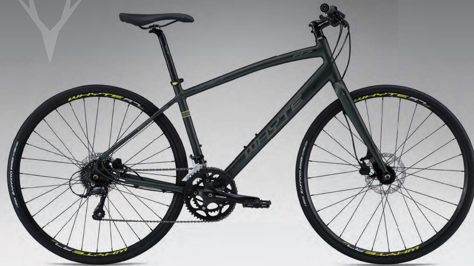
Lightweight aluminium frame with carbon fibre fork / Shimano 2x9spd drivetrain / Vittoria Zaffiro Pro with puncture protection FAST URBAN/COMMUTER - R7 SERIES