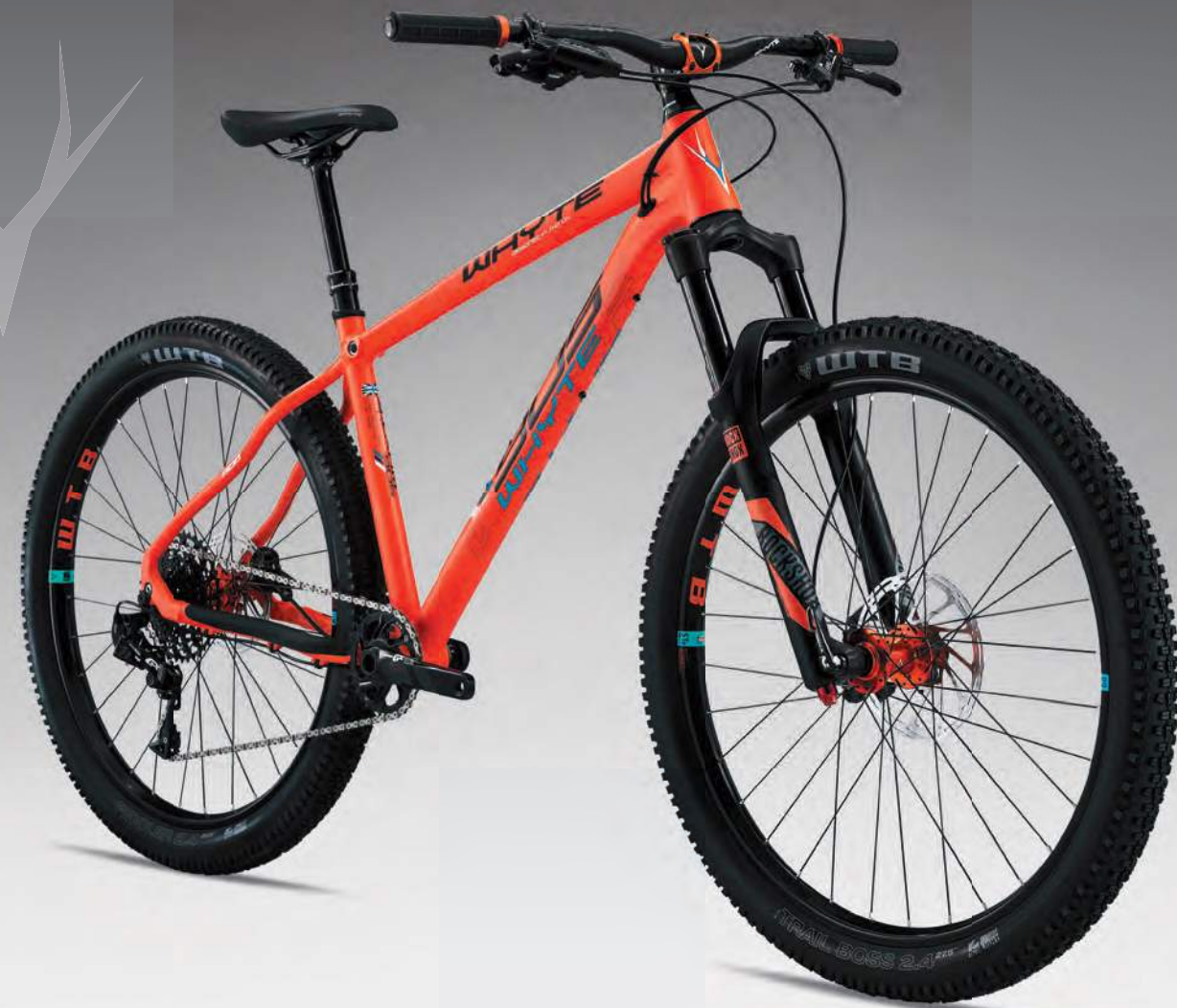
RockShox Yari RL fork / Internally routed Dropper Post / Whyte custom 760mm bar and short gravity stem/ WTB front and rear specific TCS tyres and rims TRAIL / ENDURO HARDTAIL - 900 SERIES - 130MM