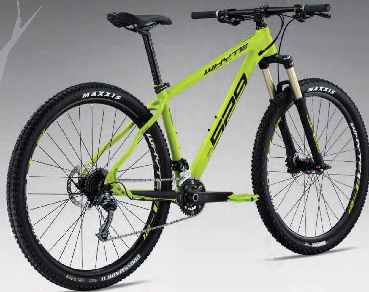
6061 Hydro Formed T6 Aluminium frame / Maxxis front and rear specific tyres / Shimano, SR Suntour 2x9spd drivetrain / SR Suntour Raidon front fork with 15mm through axle TRAIL HARDTAIL 29ER - 120MM