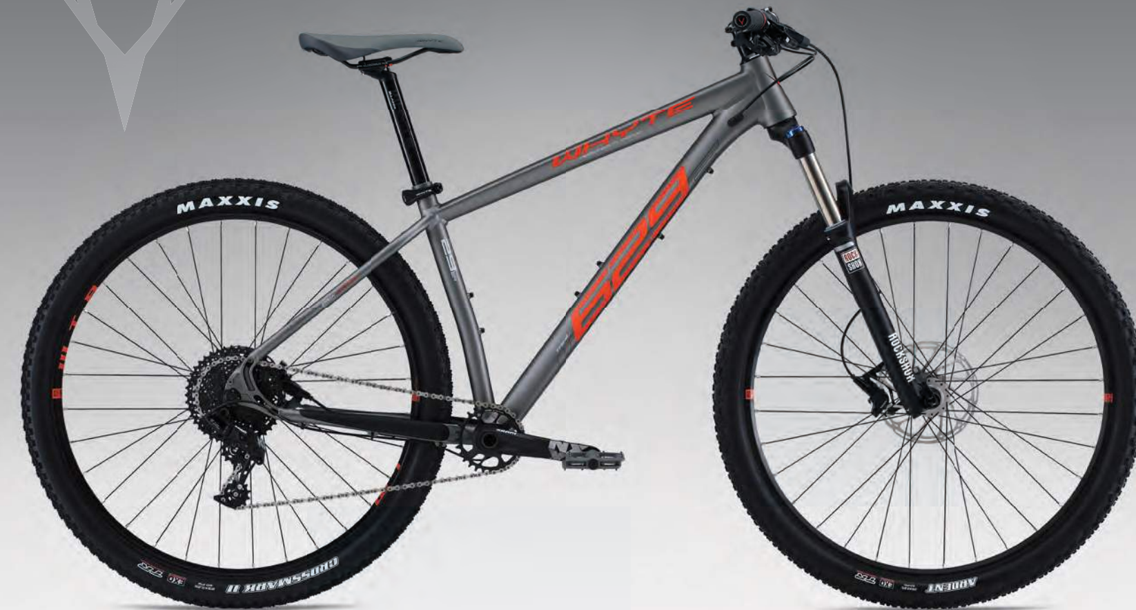
SRAM NX 1 by 11 drivetrain / RockShox Recon Silver TK air-sprung fork with 120mm of travel / Maxxis front and rear specific tyres TRAIL HARDTAIL 29ER - 120MM