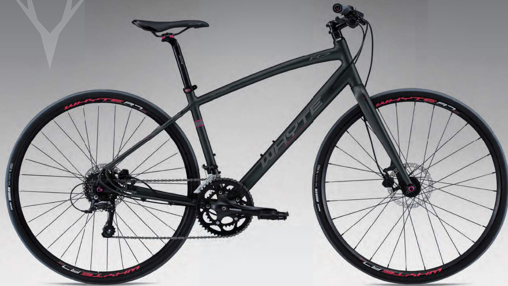
Lightweight aluminium frame with compact geometry / Shimano 2x9spd drivetrain / Carbon fibre fork with alloy steerer tube FAST URBAN/COMMUTER - R7 SERIES