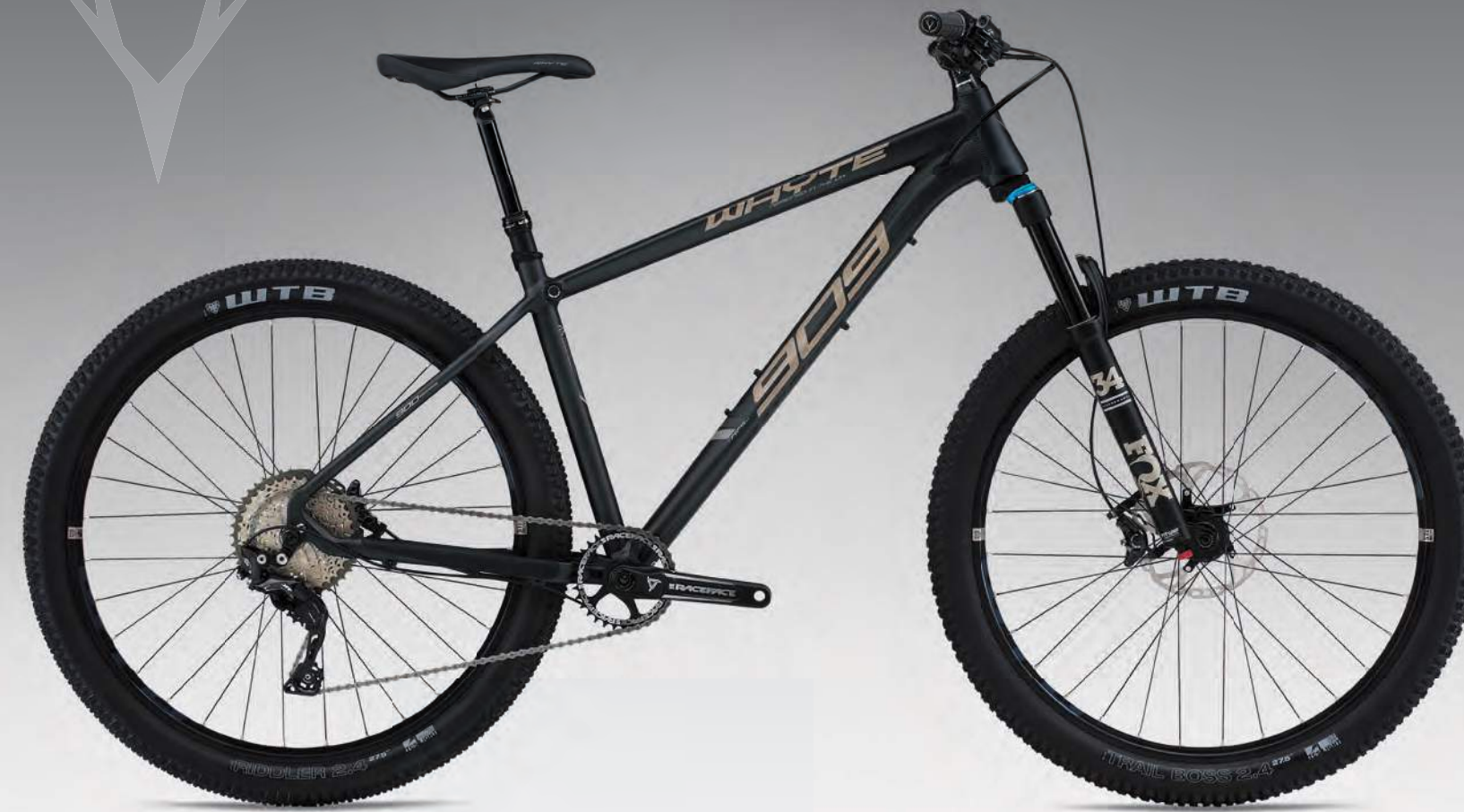
Shimano XT M8000 shifting and brakes combined with RaceFace Clinch chainset/ UK-made Hope PRO4 Boost rear hub / Fox 34 Performance fork with GRIP Damper TRAIL / ENDURO HARDTAIL - 900 SERIES - 130MM