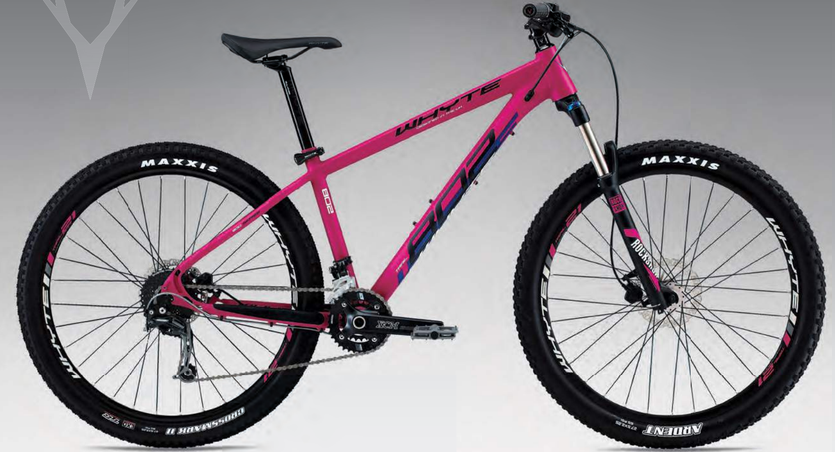
Compact geometry for riders with smaller proportions / Available in size XS / Shorter 170mm cranks as standard / Lightweight hydro formed aluminium frame TRAIL HARDTAIL - 800 SERIES - 120MM